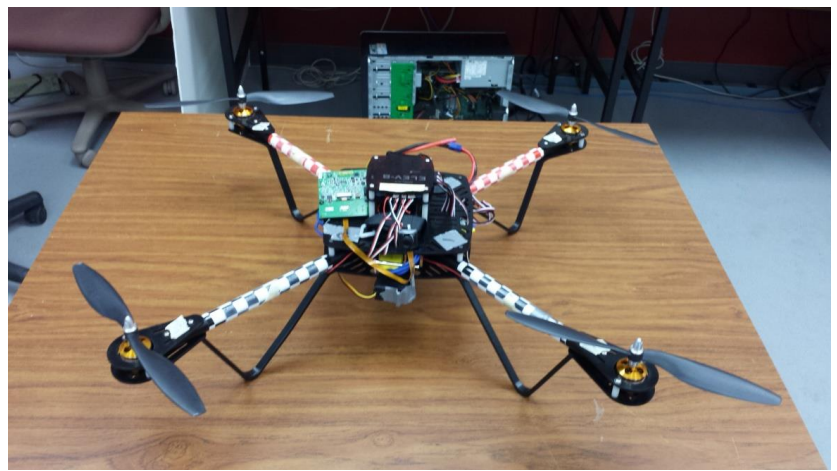
Figure 2: Conceptual Design