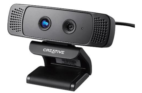
Figure 1: Senz3D Camera<sup>1</sup>

the outputs of the Raspberry Pi itself, being sent over a Wi-Fi dongle. Wi-Fi was chosen because of the abundance of bandwidth that was not available with other mediums. The Surface mentioned above will receive the Wi-Fi video feed and display it for the user. A rough assembly of this design can be seen below in Figure 2. In this design there is a small servo motor added to the elev-8 to rotate the camera from straight forward to 90 degrees downward to look below the elev-8. This was done using channel 6 in the radio frequency transceiver that was not being used prior. It will be controlled through gesture motions that will be discussed later.